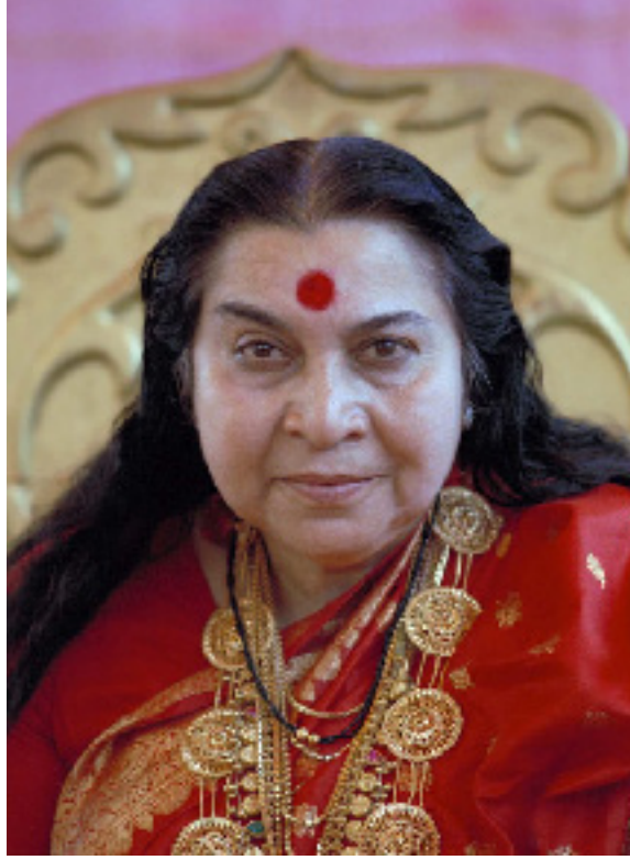
Shri Mataji Nirmala Devi